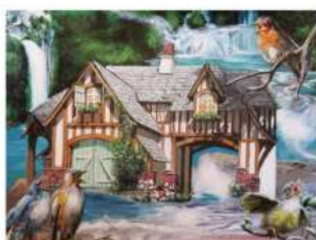
Four Calling Birds