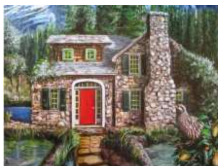
Partridge In A Pear Tree