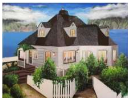
Three French Hens