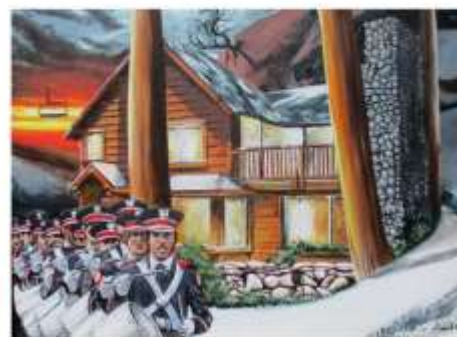
Twelve Drummers Drumming