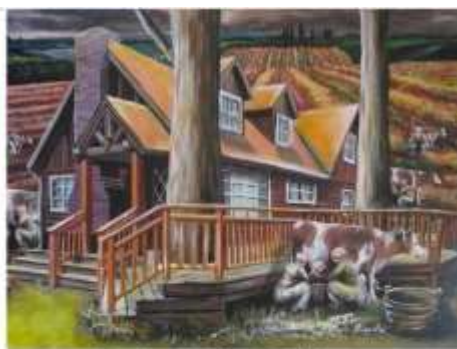
Eight Maids A Milking