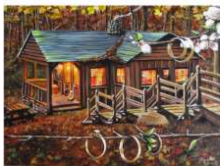
Five Golden Rings