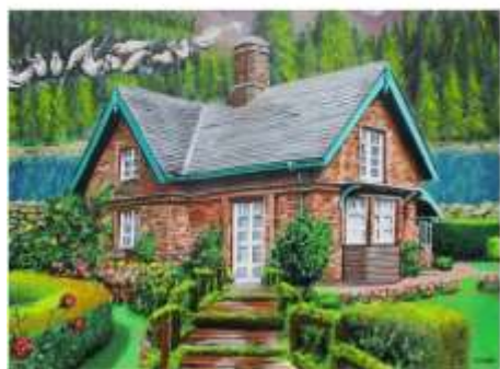
Eleven Pipers Piping