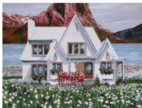
Nine Ladies Dancing