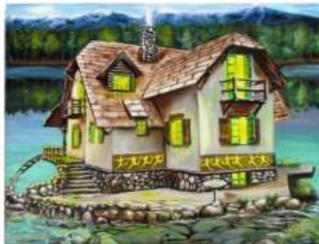
Ten Lords A Leaping