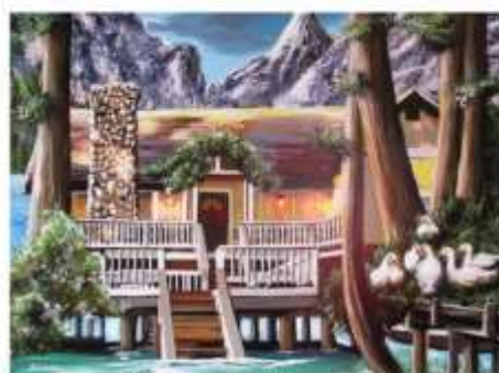
Six Geese A Laying