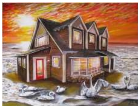
Seven Swans A Swimming