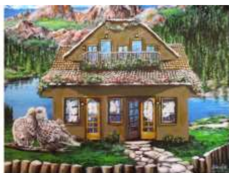
Two Turtle Doves